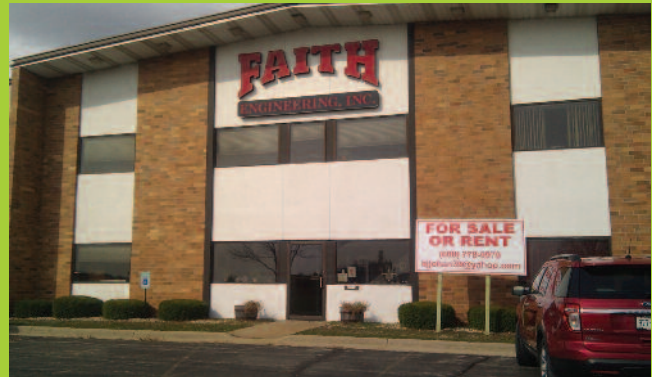
Johansen Building, located at 645 10½ Street – Monroe. 17,950 sq.ft. -For Sale or Lease.

To learn more about these buildings or to search the data base, go www.GreenCountyEDC.com and click on "sites and buildings" in the opening paragraph.